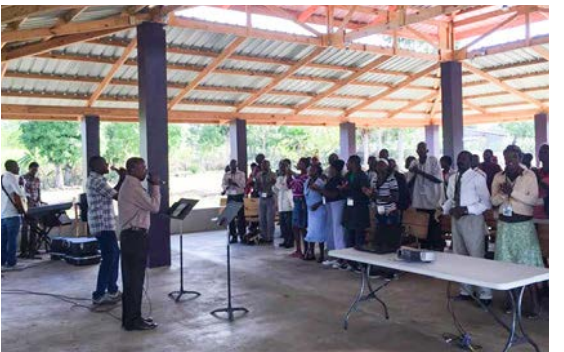
Servant-Hearted Leadership Conference