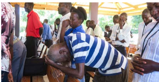
Praying during praise and worship