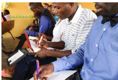
Taking notes during a conference session

Two years of curriculum came to a culmination during the final two-day 'Storyline' conference held in October. The participants reflected on scripture showing that our God is a Missionary God and that He intends to use people to GO and share the story of the Good News of the Gospel of Jesus Christ. In John 20:21 Jesus said to his disciples, "Peace be with you. As the Father has sent me, so I send you." The conference attendees heard about being ambassadors for Christ going out into the world. It is not IF we are sent, but WHERE.