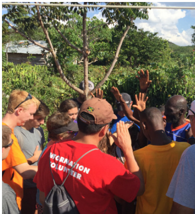
Praying for and encouraging a new believer

The work of a believer is not always easy; being on the front-line of spiritual warfare means battling attacks, rejection, and weariness. But this is also a life filled with joy, miracles, and victories. Give thanks with us as we praise God for the victories He won in the lives of these ninety-one Haitian brothers and sisters.