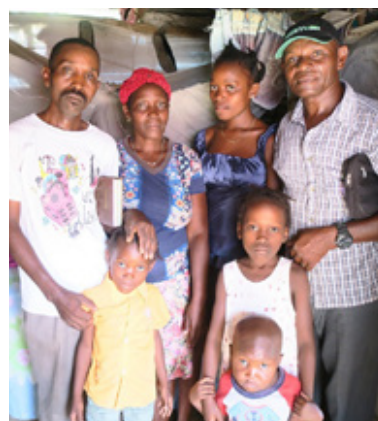
One of many home visits for Lumanes