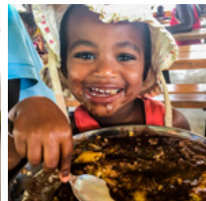
Nutritional meals will continue to be provided at lunch

If you feel led to help us impact lives through our education programs, you can donate to support a new teacher . Checks can be sent to MH4H directly to PO Box 204, Pella, IA, 50219. Or you can donate online at www.mh4h.org/donate . Donations are tax deductible.