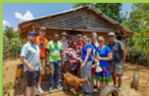
Painting and Leadership - Pella, IA April 22-29, People: 10