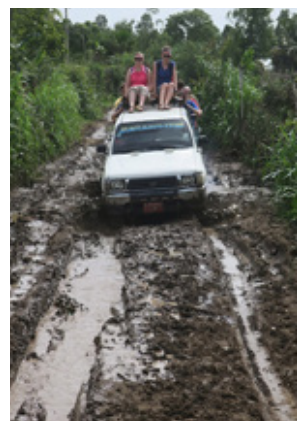
The roads after daily rains