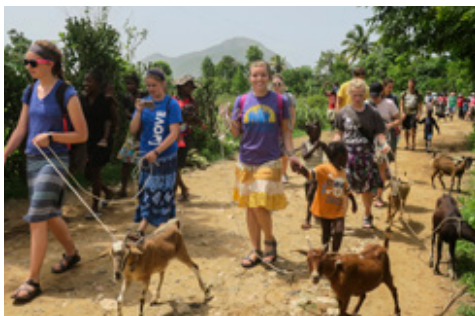
Delivering goats in Sylvain