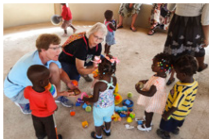
Stimulation through play is critical for cognitive development and strengthening motor-skills