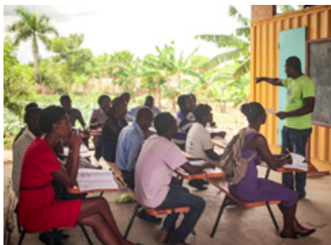
The Agronomy Technical School class

We are willfully working with determination and wisdom to further the Kingdom of God here in Sylvain and the Pignon area. Please continue to pray for God to use Agronomy to advance His plans!