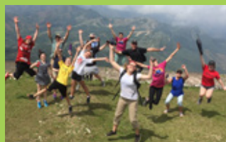
Lutheran Church of Hope, Des Moines, IA March 11-18, People: 18