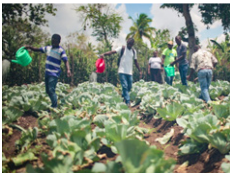
Students working in their training garden