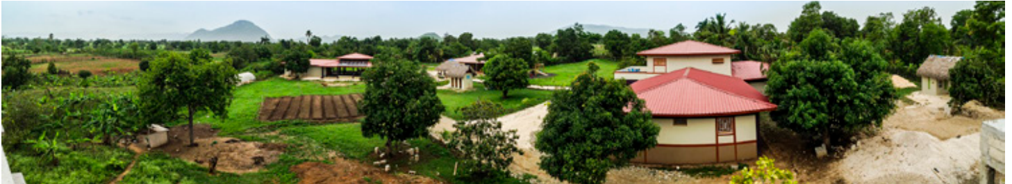
The Many Hands campus