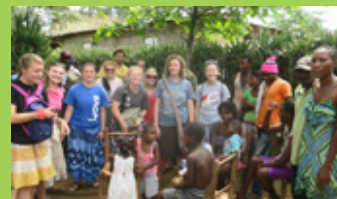
Mango Tree & Central College, Pella, IA May 18-24, People: 18