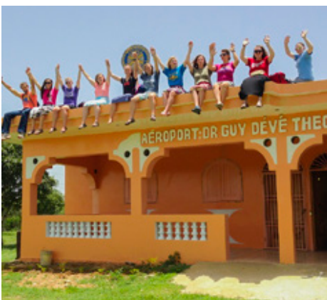
Waiting on the airstrip in Pignon