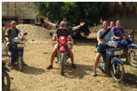
MH4H Staff ready for a home visit

The desire and reason behind every effort of Many Hands ministry is to BE that arm of a trusted friend. Praise to our Lord who is willing and able.