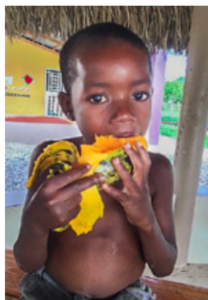
Mango season has begun