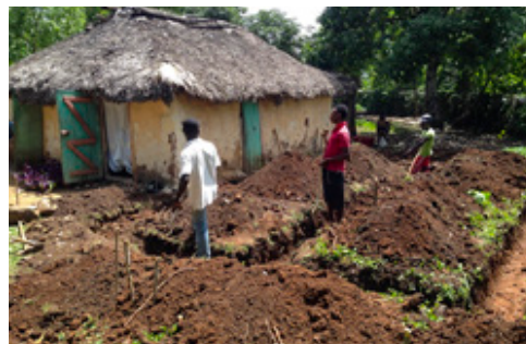
Laying the foundation for a house build