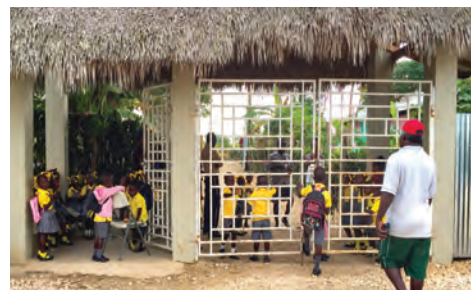
School of Light students waiting at the gate

The Yellow Iron School of Light preschool, located on the Many Hands for Haiti (MH4H) campus, is operating at full capacity for the first time in its three-year history. This means that all three of our classrooms are occupied with what we call the PS1, PS2, and PS3 classes. This is very exciting and is the realization of a vision that was cast several years ago to have a fully operational preschool as part of the MH4H ministry in Haiti.