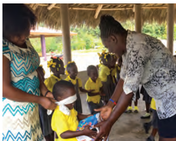
Students playing learning games