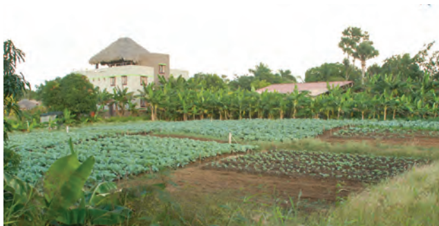
The Community Garden on the Many Hands campus