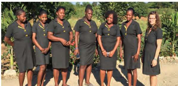
Yellow Iron School of Light staff in their new uniforms