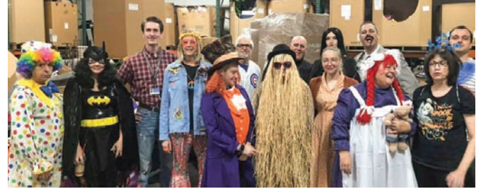
Volunteer and staff Halloween party, Grimes, Iowa