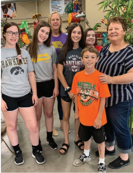
Generations of families volunteering together