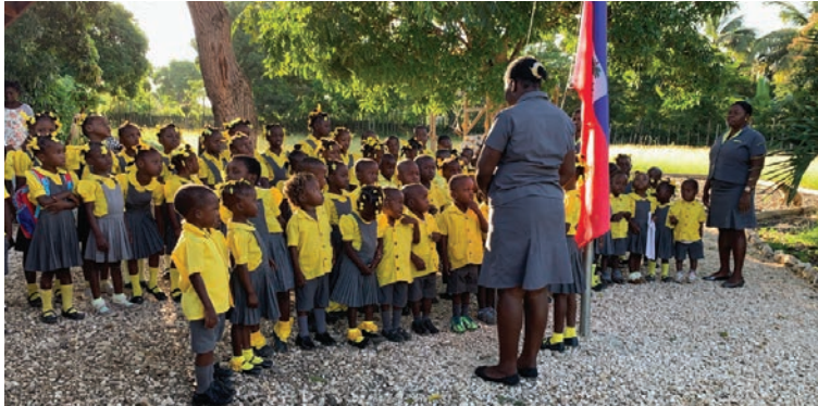
The morning flag raising ceremony for students at the School of Light