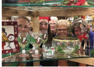
Preparing for Christmas, Spencer, Iowa