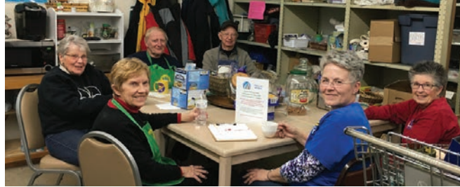
During a break at the back of the store in Spencer, Iowa