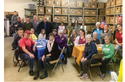
Volunteers and staff together, Spencer, Iowa

It has been a great year full of many exciting events and activities for Many Hands. We are thankful for the many people who serve as volunteers stateside for our organization and allow us to accomplish all that we do. So far this year, we have had 903 individuals collectively volunteer for 17,970 hours. Praise God that so many people are willing to give their time, energy and resources to help further our mission both in the U.S. and in Haiti!