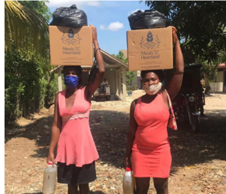
Program participants and their distribution packages