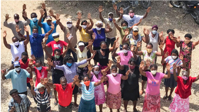
Staff share a brief moment together on campus during a food distribution