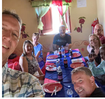
Many Hands staff enjoy lunch together