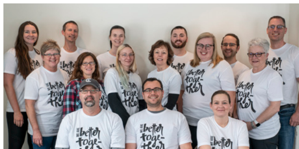
Staff and supporters together as a team