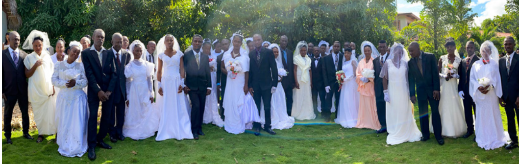
All the couples celebrate together on their big day