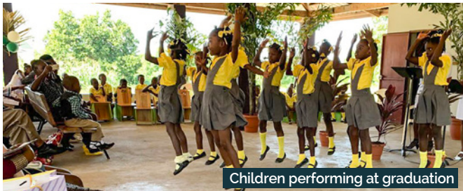
Children performing at graduation