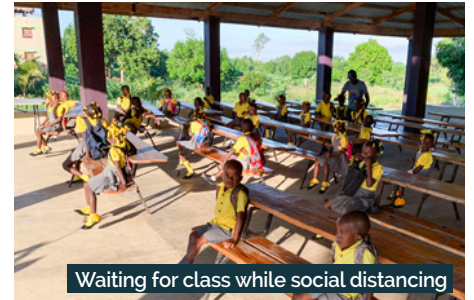
Waiting for class while social distancing