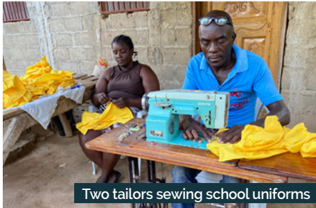
Two tailors sewing school uniforms