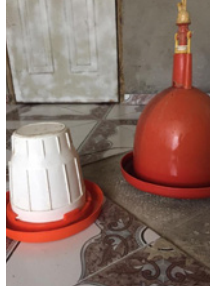
Systems and medicines they learned about