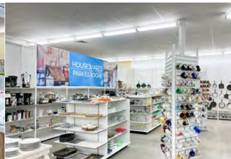
A view of the Housewares section