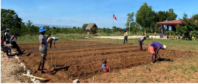
New ground being broken for the next Alpha Garden on campus