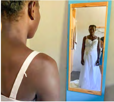
A bride-to-be sees her dress for the first time