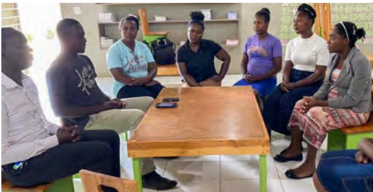
Staff unite together for a time of prayer for Many Hands and Haiti