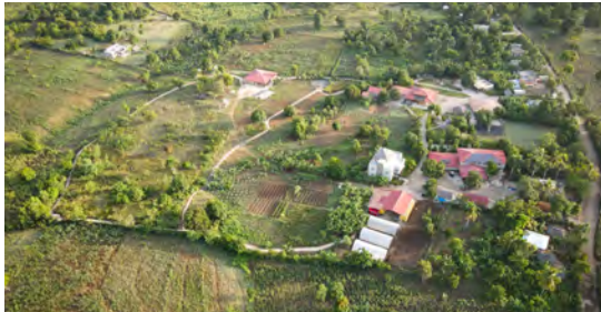
Many Hands campus in Pignon

As I write this 2021 year-end letter, the past 12 months come flooding back. Haiti hasn't experienced a year like this quite possibly in the history of the country. The trauma was deep, with a president assassinated, earthquakes leveling a major city, and unprecedented gang violence as a result of unresolved systemic issues from the 2010 earthquake. Coming into 2021, the one-word God revealed to us was generosity . We had no idea how generous we would need to be in serving our community and the country around us. Through our generosity, we were able to demonstrate God's love to so many people from across the world. Because of our generosity, we had news stories and podcasts done about us from National Christian Foundation and Live Inspired. We were covered by Iowa news stations multiple times. We won awards from magazines. Most importantly, this allowed us to point back to Jesus, who was the most generous person to ever live. It is because of Jesus' generosity we can freely give and demonstrate God's unwavering love for us. It is the fuel that fires our generosity engines. Let me share some tangible ways this generosity cry manifested itself in 2021: