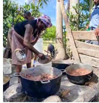
A cook prepares food for a school