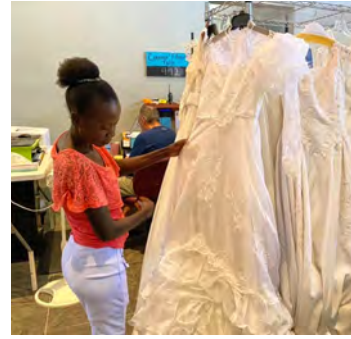
A bride-to-be looking at dresses