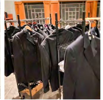
Men's suits ready to be fitted

Many Hands is preparing to hold its fifth annual "Wedding Day." Conceived by the Many Hands Chaplains, this day has brought joy to couples and strengthened families. On December 18, another 20 couples will share their vows before God, celebrating with friends and family. This will bring the total number of marriages held through this ministry to 124. With 2021 having been one of the hardest years for Haiti in recent memory, our Chaplains consider this program essential during these tough times.