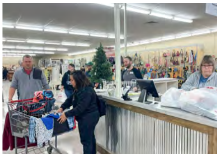
Customers check out on opening day