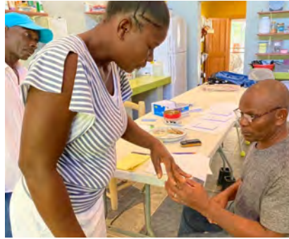
Lumanès fitting rings for couples