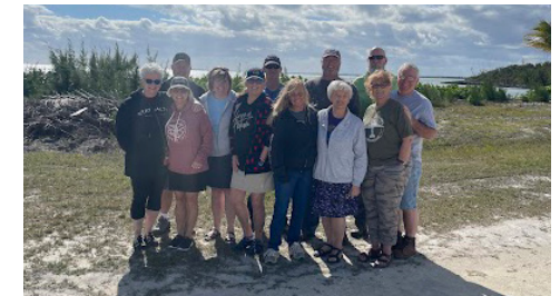
Spencer Team, Spencer IA January 14-21 | People: 12