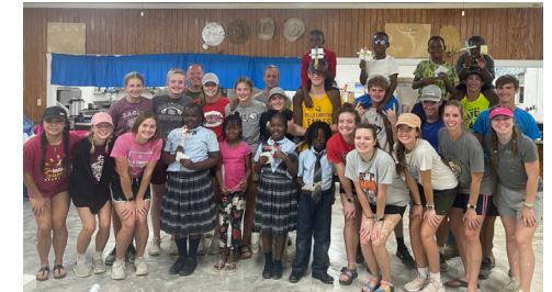
Pella Christian 2023 Winterim Team, Pella IA January 3-9 | People: 20