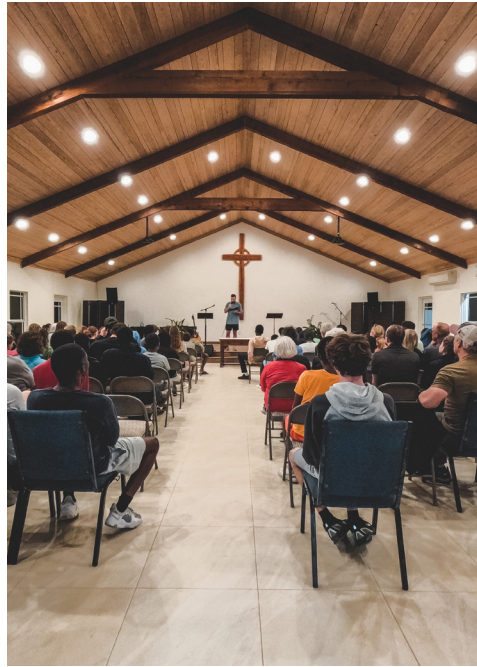
The Way IMPACT Team at Kirk of the Pines Church