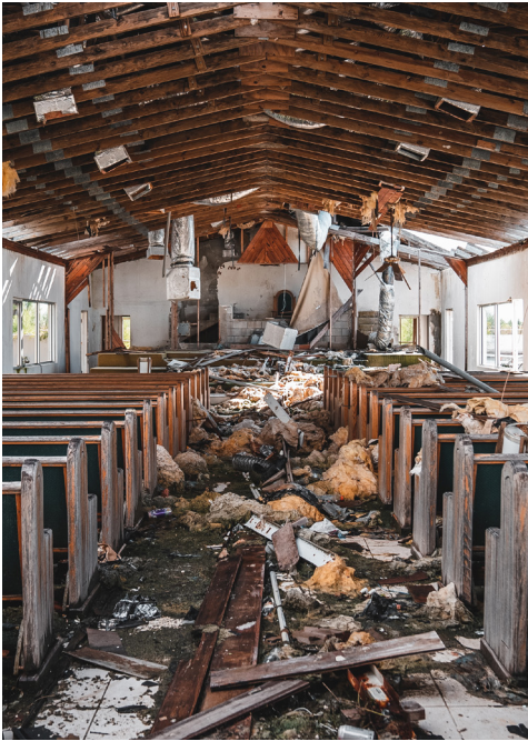
A church in Marsh Harbour with left-over damage from Hurricane Dorian