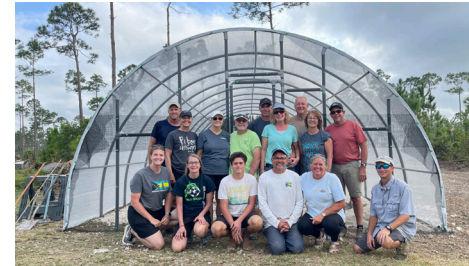
Third Church, Pella IA February 14-21 | People: 8