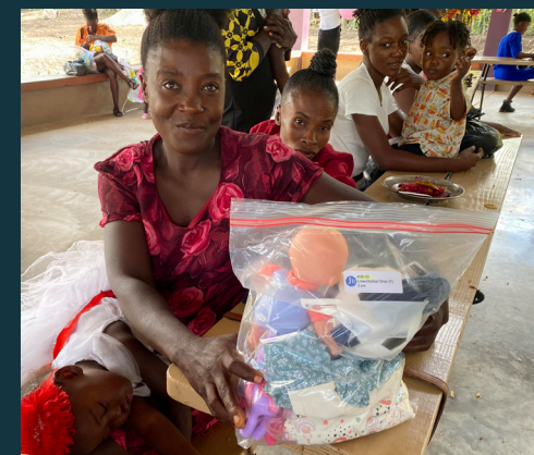
A mother receives gifts at the First 1,000 Days Christmas Party

In December, we held our annual Christmas celebration with our First 1,000 Days families. Across our three Love-In-Action Centers, mothers and children enjoyed a Christmas meal – followed by worship, games, and the Project Christmas Love distribution at each location. We are humbled by the many generous churches that send Christmas gifts every year for both our mothers and children.