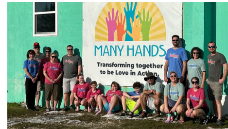
The Way Church, Pella IA February 5-11 | People: 15