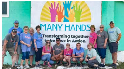
Lutheran Church of Hope, West Des Moines, IA April 14-21 | People: 13