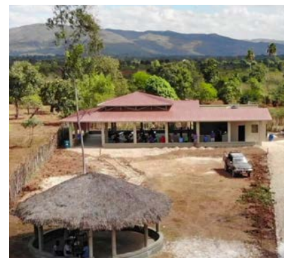
Many Hands' Love-in-Action Center in Malialette

Both organizations are thrilled about seeing the impact their partnership will have and look forward to building strong foundations for families in the Central Plateau.