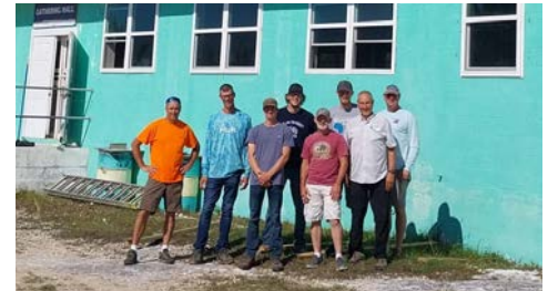
Excel Electric, Grandville, MI May 12-20 | People: 7