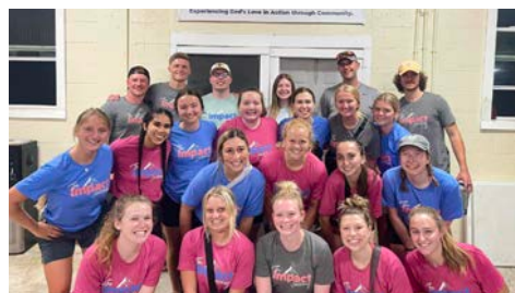
Kairos, Ames, IA May 19-26 | People: 22