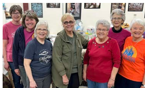
Staff and volunteers at the Spencer Volunteer Appreciation