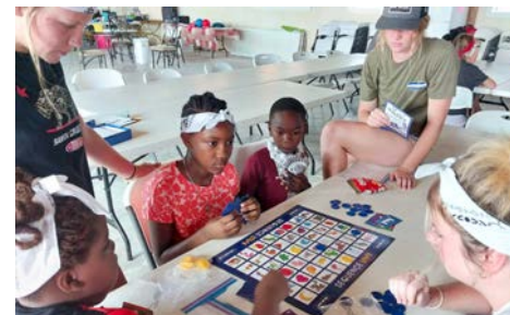
The Central Valley Christian School team helps local students at a reading camp