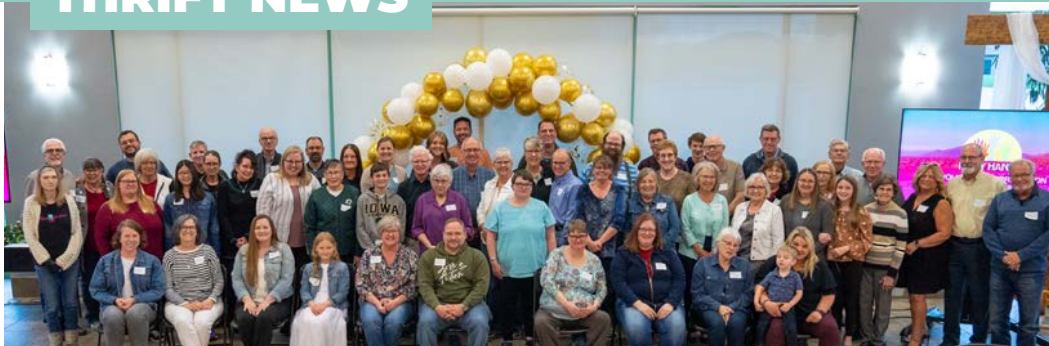
Staff and volunteers at the Metro Volunteer Appreciation