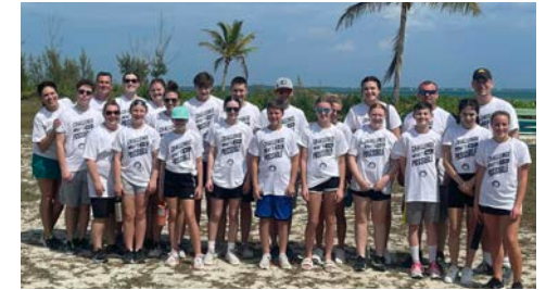
Third Family Trip, Pella, IA March 12-17 | People: 21