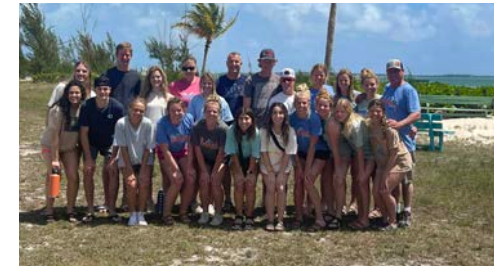
Central Valley Christian, Ceres, CA April 1-8 | People: 23