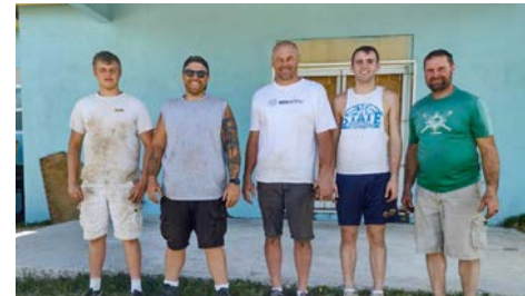
Joel Vos Roofing, Sully, IA March 14-21 | People: 4