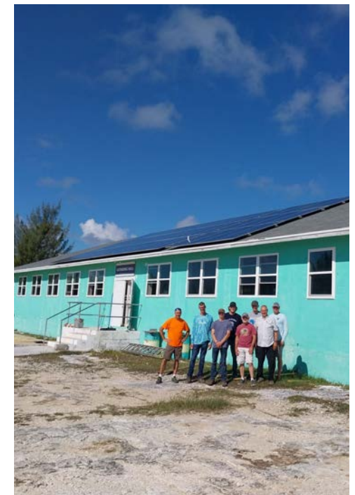
The Excel Electric team from Michigan stands in front of the newly installed Camp Abaco solar panels