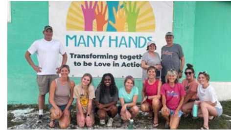
Michigan Crew, MI February 28 - March 7 | People: 11