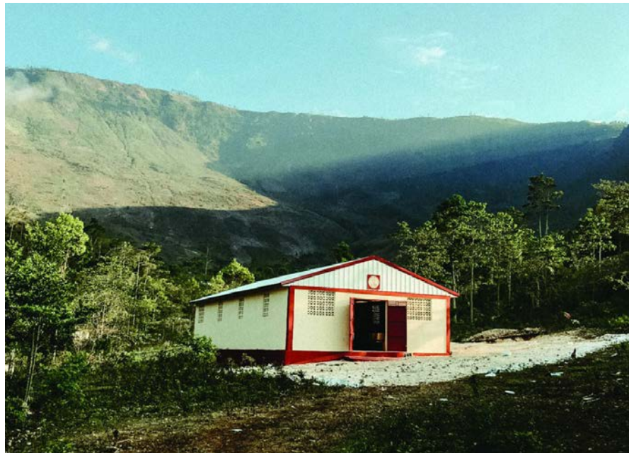
A church in the One Body Project