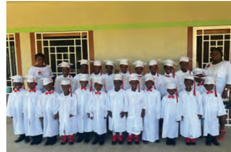
Preschool students at the School of Light celebrate graduation with a ceremony with teachers and family