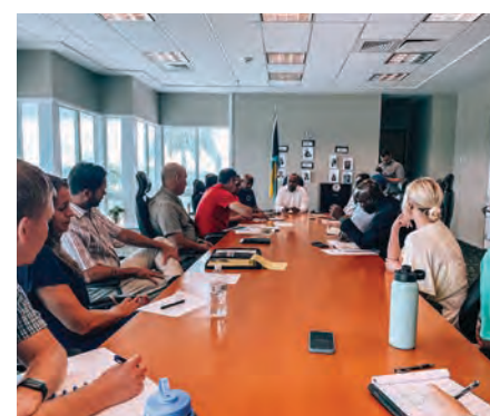
The Many Hands team meets with Bahamian Government Officials to discuss work in Abaco