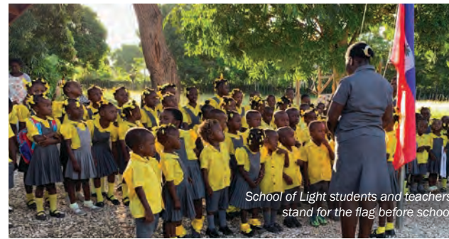
School of Light students and teachers stand for the flag before school