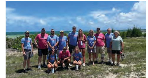
Celebrate Church, Knoxville, IA June 15-22 | People: 13