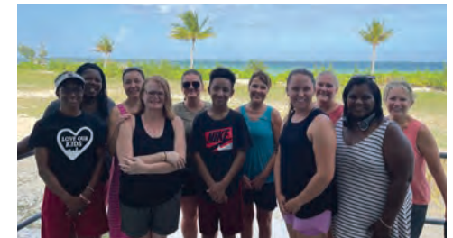
New City Church, Des Moines, IA August 7-13 | People: 11

Are you interested in being a part of an Impact trip?