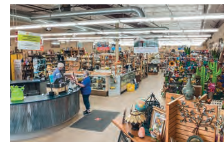
A view inside the Many Hands Market in Spencer, IA