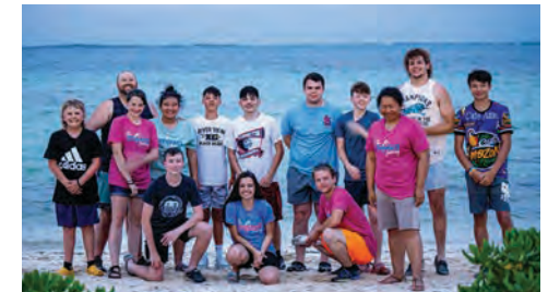
Fresno Bible Church, Fresno, OH June 6-12 | People: 14