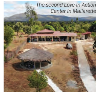
The second Love-in-Action Center in Maliarette