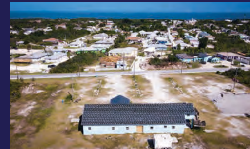
Aerial view of the Murphy Town Community Center during construction

Many Hands for Abaco is thrilled to announce a partnership between Many Hands and SOL Relief, two organizations dedicated to making a lasting impact in the communities on Abaco Island. This partnership aims to rebuild and empower the resilient community of Abaco by renovating the Murphy Town Community Center, heavily damaged during Hurricane Dorian in 2019.