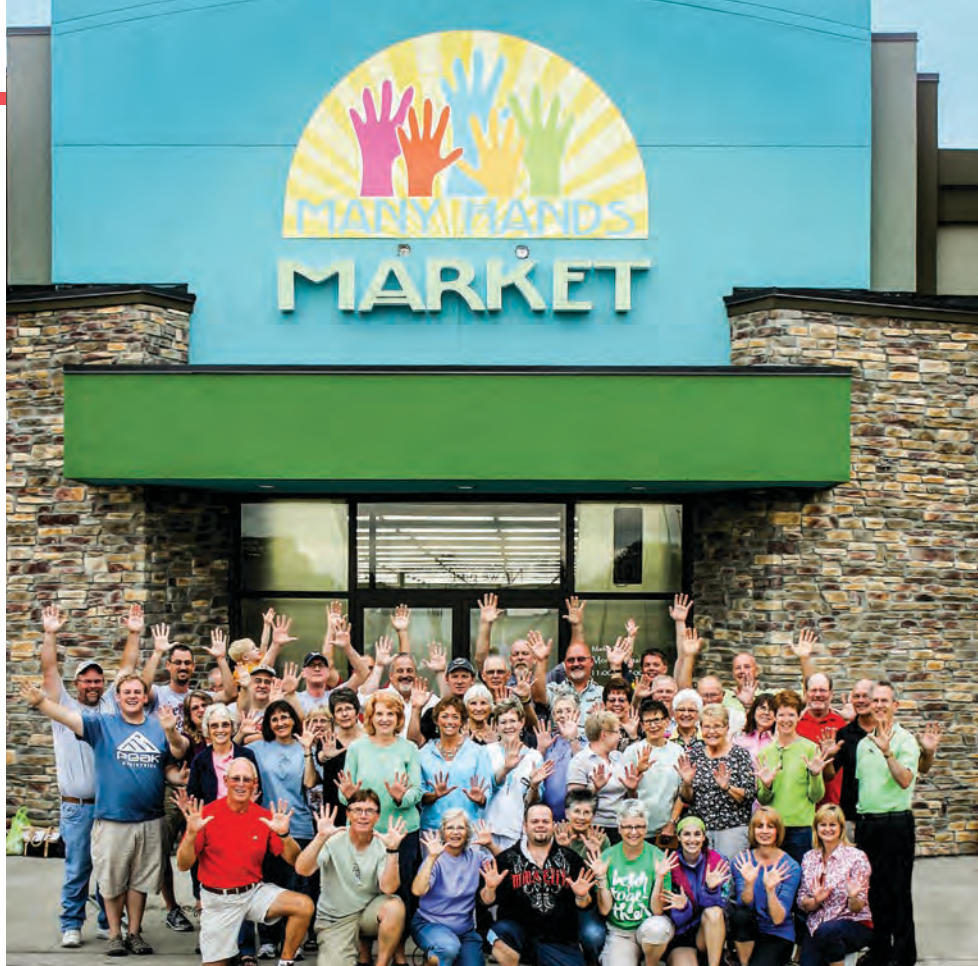
Many Hands Thrift Market staff pose for a photo outside the Spencer store in 2013