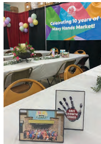
A view of the decorations for the 10th anniversary celebration