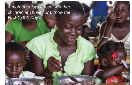
A mother enjoys a meal with her children at Thrive For 5 (now the First 1,000 Days)