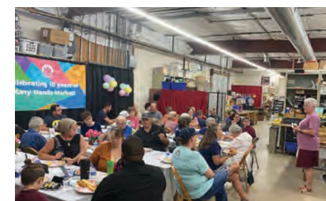
Staff and volunteers at Many Hands Thrift Market during store's 10th-anniversary celebration