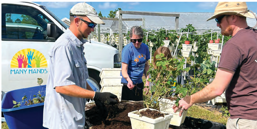
Workers harvesting plants at Driftwood Farms