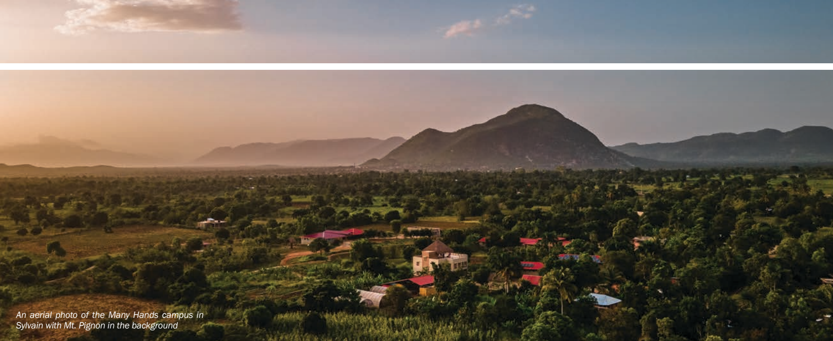
An aerial photo of the Many Hands campus in Sylvain with Mt. Pignon in the background

and the Sylvain Christian School of Light Fundamental School opening on the Sylvain campus in September of that year. This school provided education for 78 children, with the capacity to add a new class every year for the next eight years.