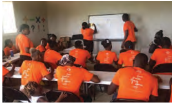
Students learning to read and write in the Lekòl Alfa literacy class