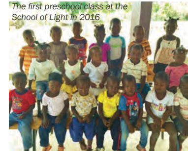
The first preschool class at the School of Light in 2016