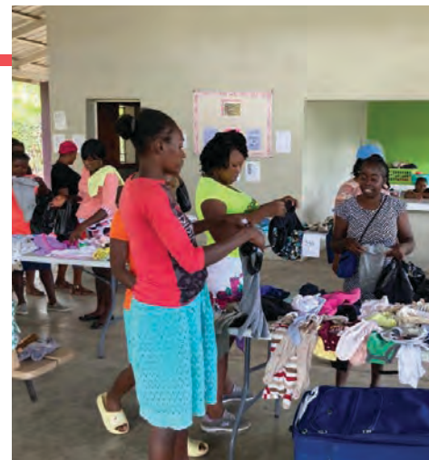
First 1,000 Days mothers shop at “Ti Mache” (little store) for personal and household items.

The stories of individuals like Juliciana, a mother and grandmother who faced the loss of her husband during the class, and Ely, a dedicated father from the First 1,000 Days program, are inspiring examples of per-