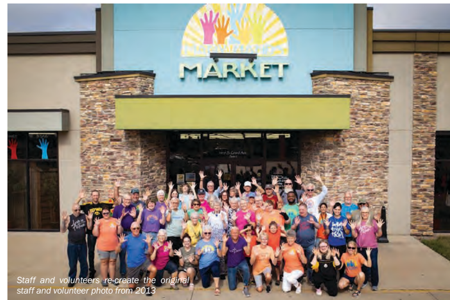
Staff and volunteers re-create the original staff and volunteer photo from 2013

After a decade of trusting completely in His plan – as I stepped into the Manager position in April 2014 – I knew that we would only make this work by putting our hands in His and following His footsteps. God gets all the glory, and we will keep seeking Him as we step into year 11.