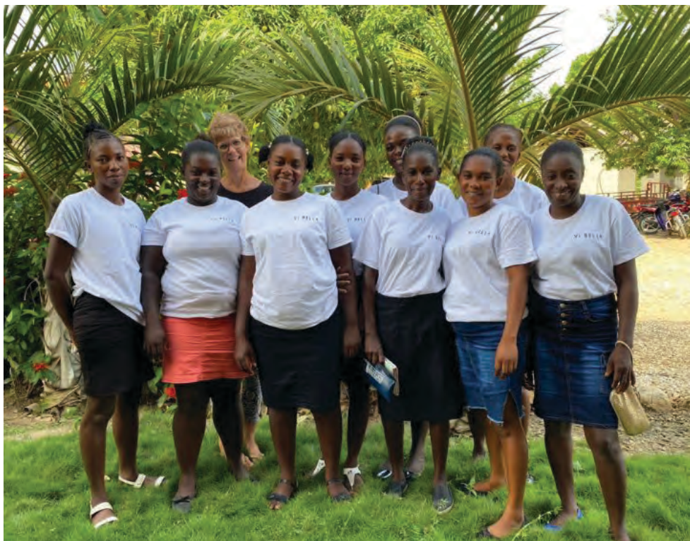
Staff and new artisans pose for a photo on the Many Hands Sylvain campus