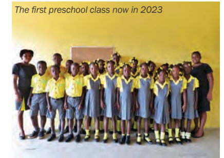
The first preschool class now in 2023