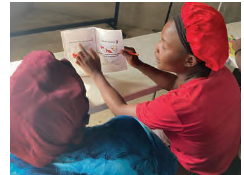
Students learn to read out loud to each other during class.