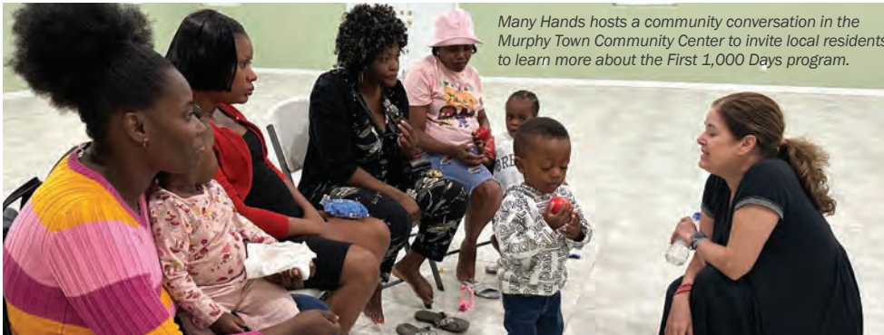
Many Hands hosts a community conversation in the Murphy Town Community Center to invite local residents to learn more about the First 1,000 Days program.