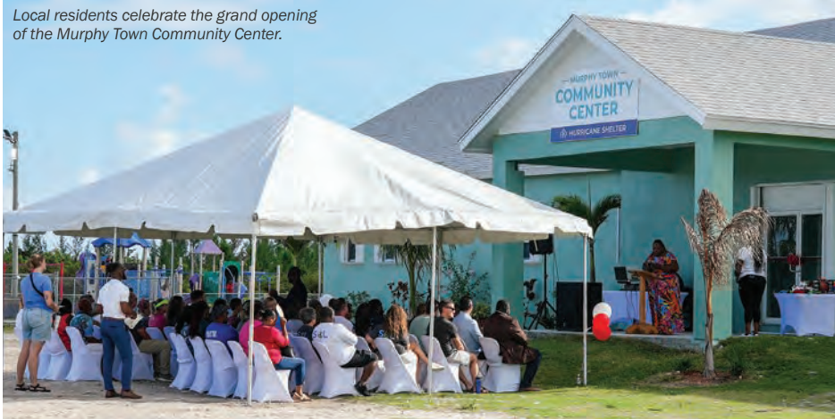
Local residents celebrate the grand opening of the Murphy Town Community Center.