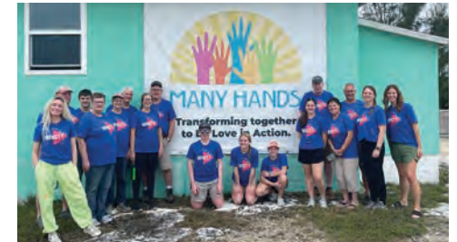
Haven Church, Grand Rapids, MI February 13-20 | People: 17