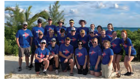
Pella Christian Winterim, Pella, IA January 2-9 | People: 24

Donate to become a foundational supporter of the First 1,000 Days program in Abaco.