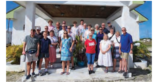
Many Hands Thrift Market & InOnTime January 23-30 | People: 13 & 12