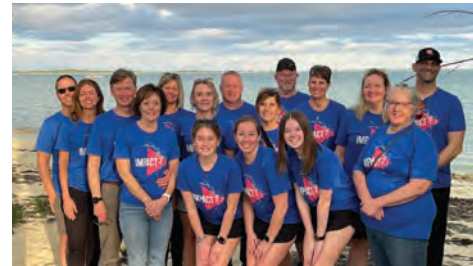
Church Of The Way, Newton, IA February 3-10 | People: 16